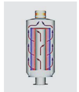
Right: SOMOS® single chamber desiccant bed for optimizing desiccant utilization with cost benefits thanks to rapid and energy-efficient desiccant regeneration.

Are you interested in receiving additional information? Then feel free to call us.