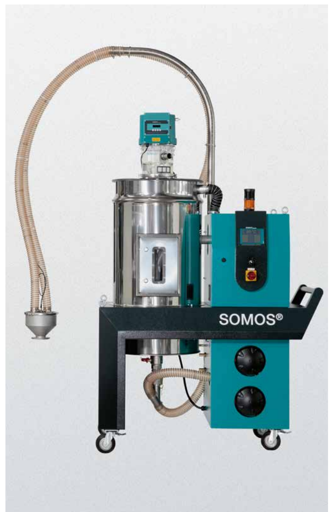
Above left: RDM-140 mobile dryer Above right: 6" touchscreen display Right: RDM-70 mobile dryer with dry air conveying

* depending on material, see throughput table